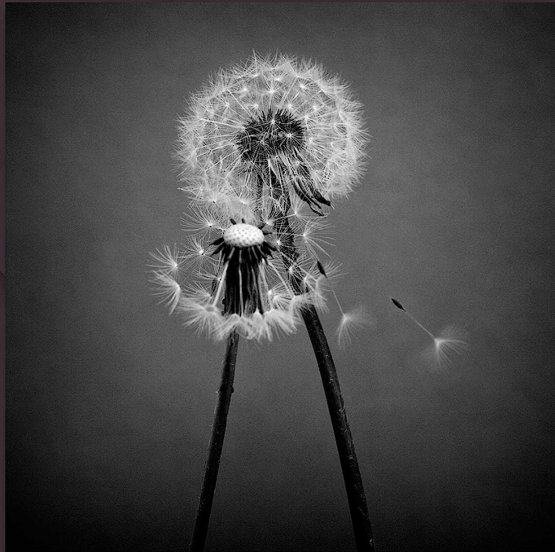
PIETRINO DI SEBASTIANO