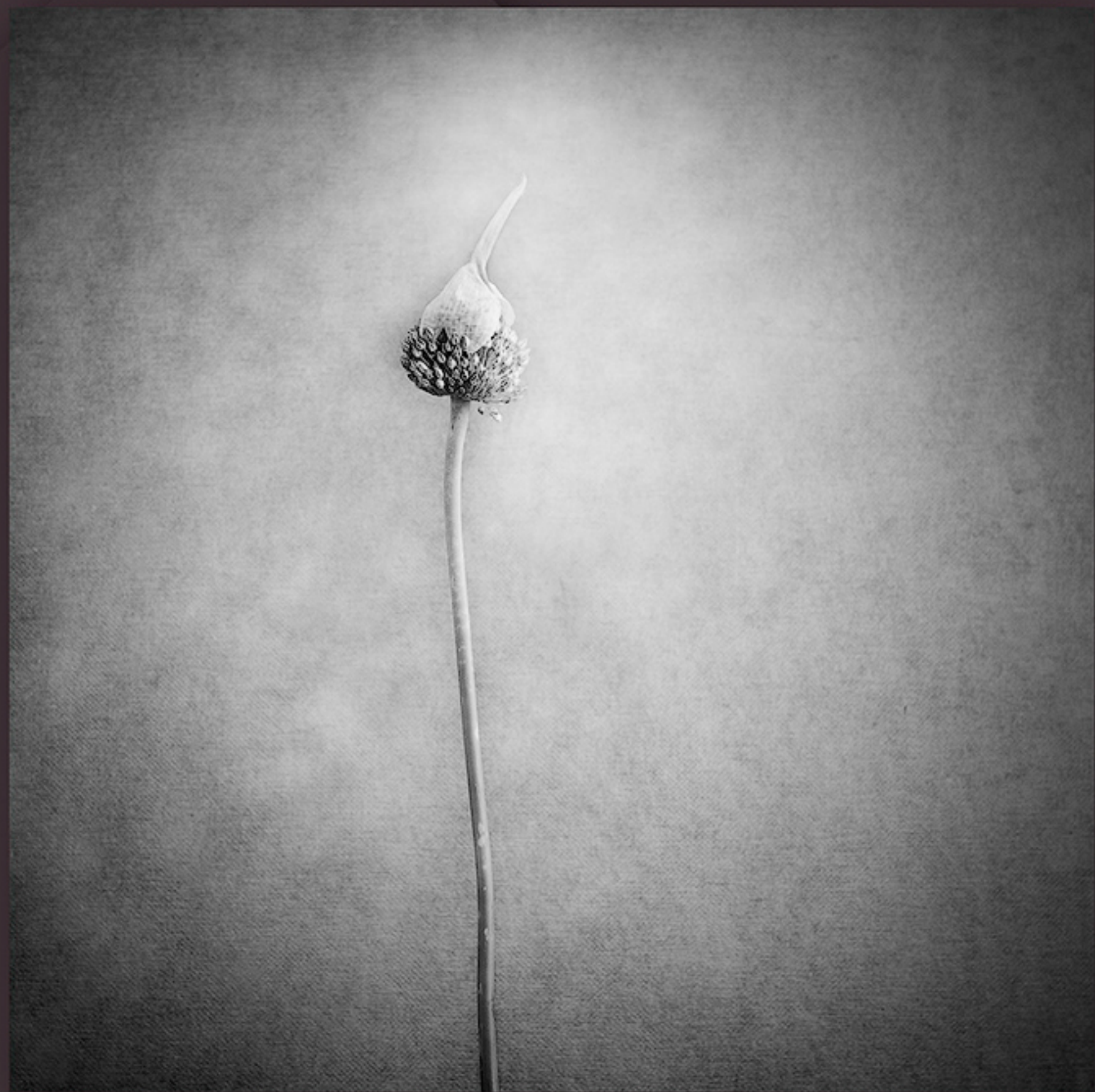
PIETRINO DI SEBASTIANO