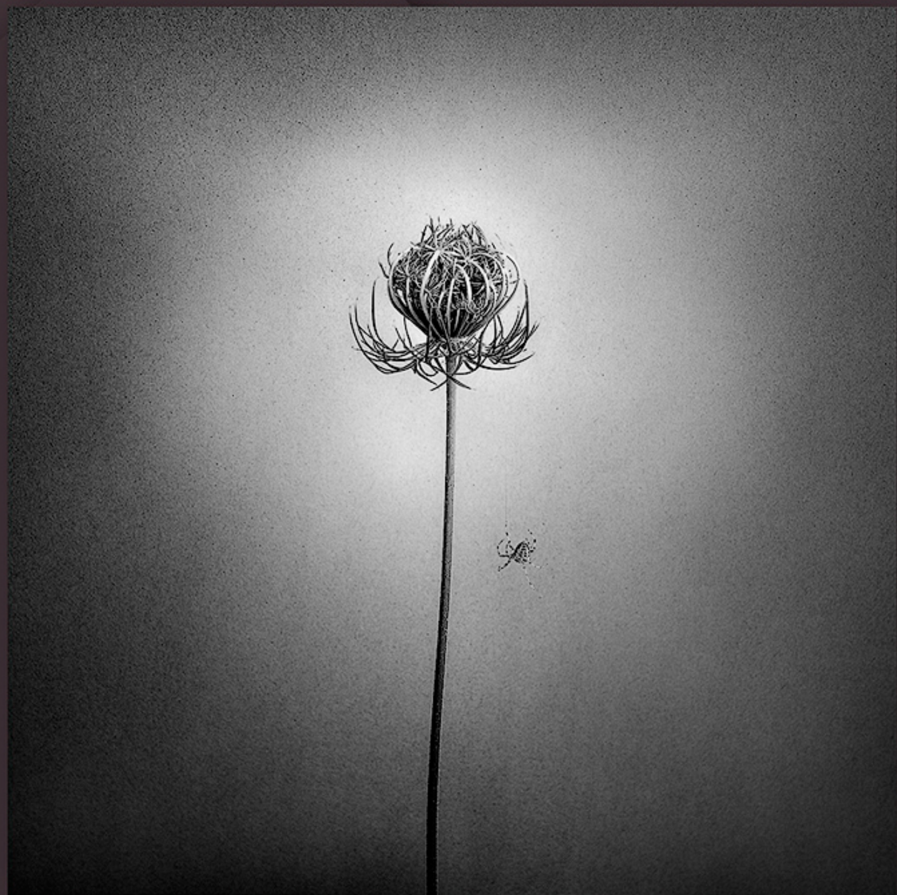
PIETRINO DI SEBASTIANO