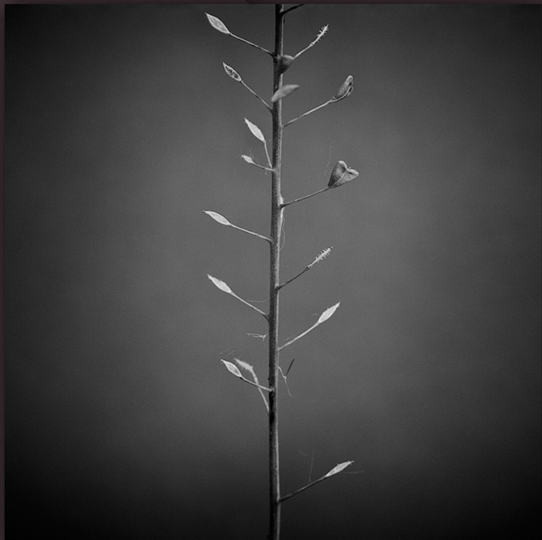
PIETRINO DI SEBASTIANO