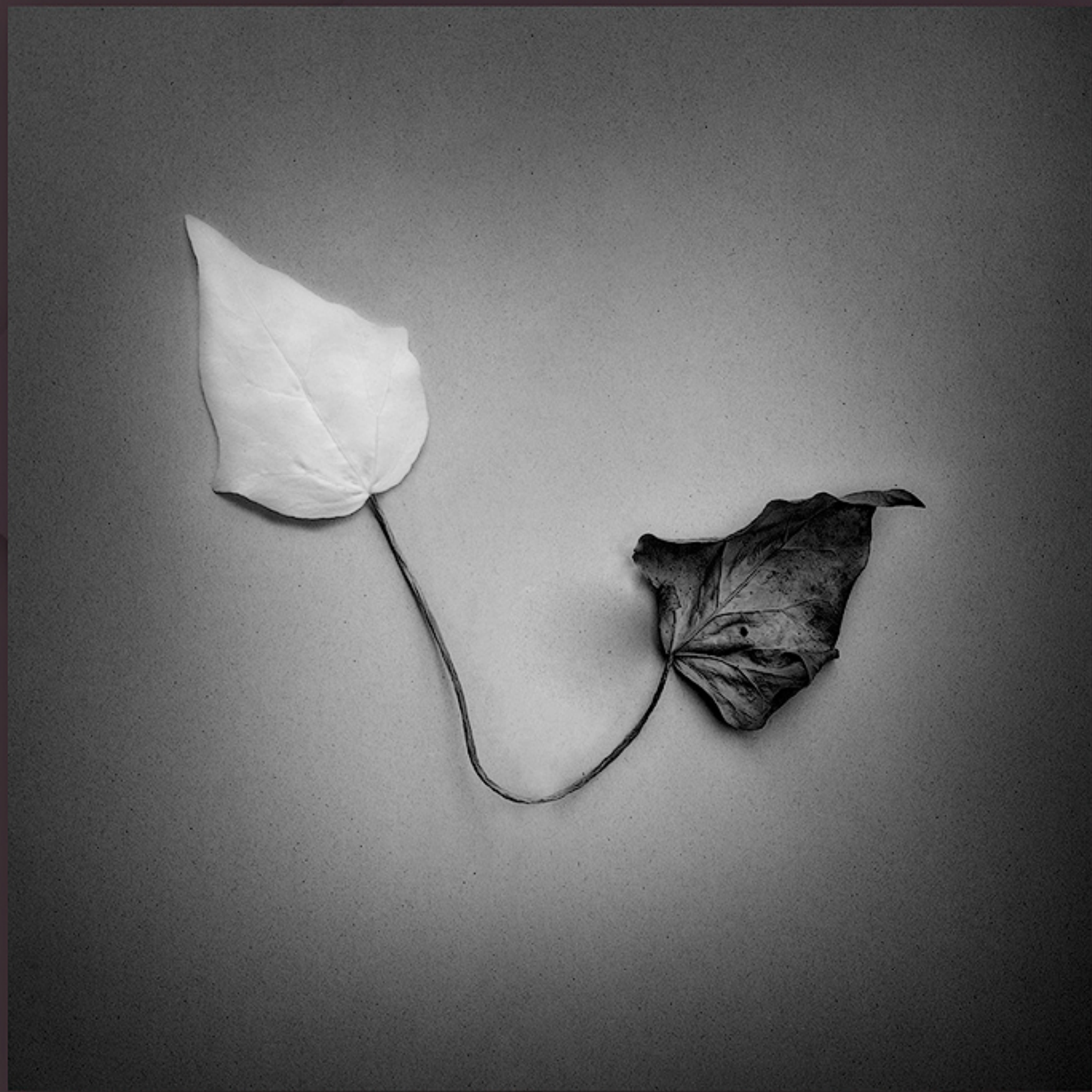
PIETRINO DI SEBASTIANO